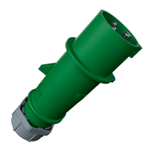
Part no. 2195