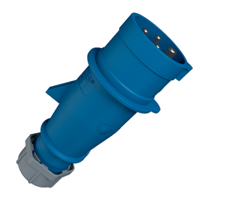
Part no. 22262