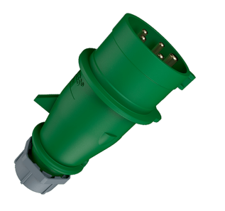
Part no. 2178