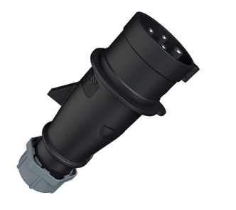
Part no. 20781