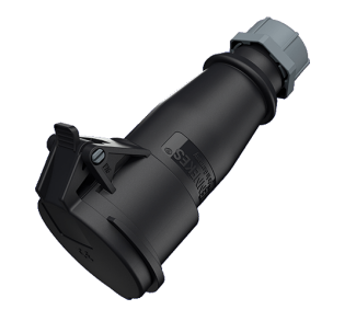
Part no. 21877ZC